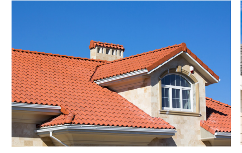
TILE (CLAY & CONCRETE) Three-year weathered SRI range: 4-91

VARIOUS FACTORS CAN INFLUENCE a material's Solar Reflectance and the resulting calculated SRI value. Below are examples of the three different types of roofing products, along with the range of three-year weathered SRI values found in the CRRC Rated Roof Products Directory for products of each type. SRI values can vary greatly within a material type. Home and building owners, developers, and roofing contractors can consult the CRRC Directory to identify the SRI value for a specific product or browse by color, manufacturer, and more.