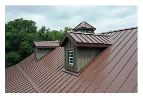
FACTORY-COATED METAL Three-year weathered SRI range: 20-90

SRI ranges are based on products listed on the CRRC Rated Roof Products Directory (https://coolroofs.org/directory/roof). These examples represent all rated products of a given type at the time of publishing, regardless of material color or other variables.