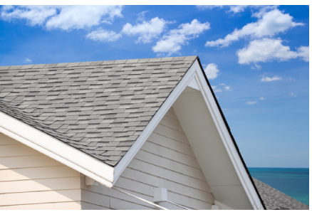
ASPHALT SHINGLES Three-year weathered SRI range: 14-34